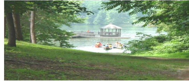
W.E. Skelton 4-H Educational Center at Smith Mountain Lake, Wirtz, Virginia

Alleghany, Augusta, Bath, Highland & Rockingham