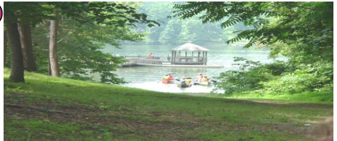
W.E. Skelton 4-H Educational Center at Smith Mountain Lake, Wirtz, Virginia

Alleghany, Augusta, Bath, Highland & Rockingham