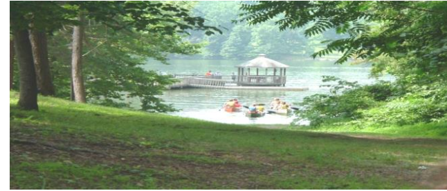
W.E. Skelton 4-H Educational Center at Smith Mountain Lake, Wirtz, Virginia

Alleghany, Augusta, Bath, Highland & Rockingham